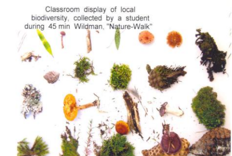
Classroom display of local biodiversity, collected by a student during 45 min Wildman, "Nature-Walk"