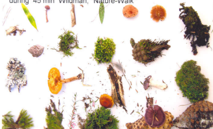
Classroom display of local biodiversity, collected by a student during 45 min Wildman, "Nature-Walk"