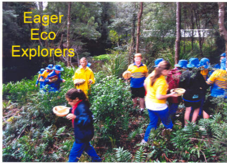
Eager Eco Explorers

Day Rate: $875.00 +GST for 5 x 45-minute sessions. Maximum 30 students per session. Bookings & Enquiries: Nexus Arts www.nexusarts.com.au (Ph) 03 9528 3416 or Freecall 1800 675 897 (fax) 03 9523 6866 Email nexusarts@netspace.net.au