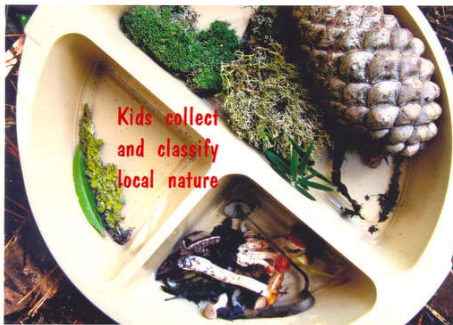
Kids collect and classify local nature